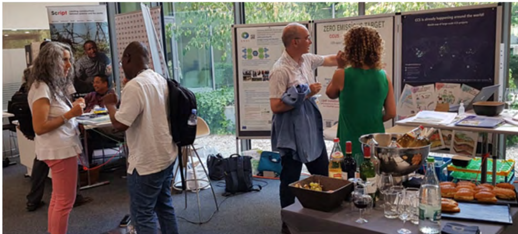
Coffee & cake” event at WCSJ