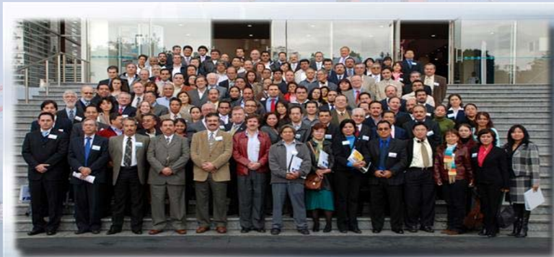
Taller de Secuestro y Captura de CO 2 (CCS) México, D.F. 9 Y 10 de julio del 2008 Museo Tecnológico de la CFE