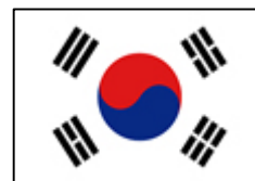
Republic of Korea